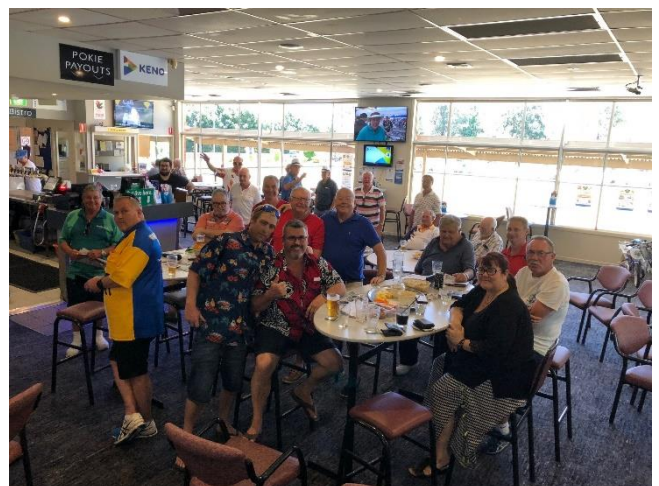
Punters Club end of year party