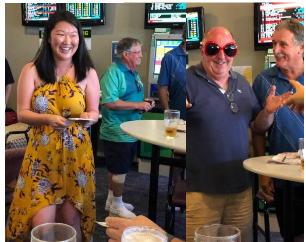
Beauty and the Beast