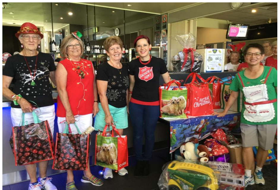
Our Ladies with donations to the Salvation Army at our Christmas Party

The annual "Battle of the Sexes" and Presentation Day was great fun and congratulations to the