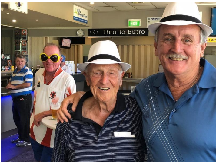
Punters Club end of year party