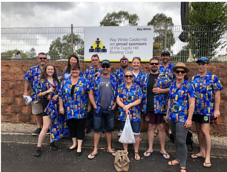
Tunnellers cruise weekend started at the Bowlo