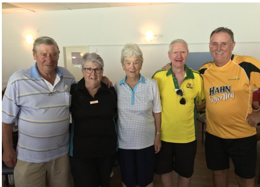
Australia Day winners